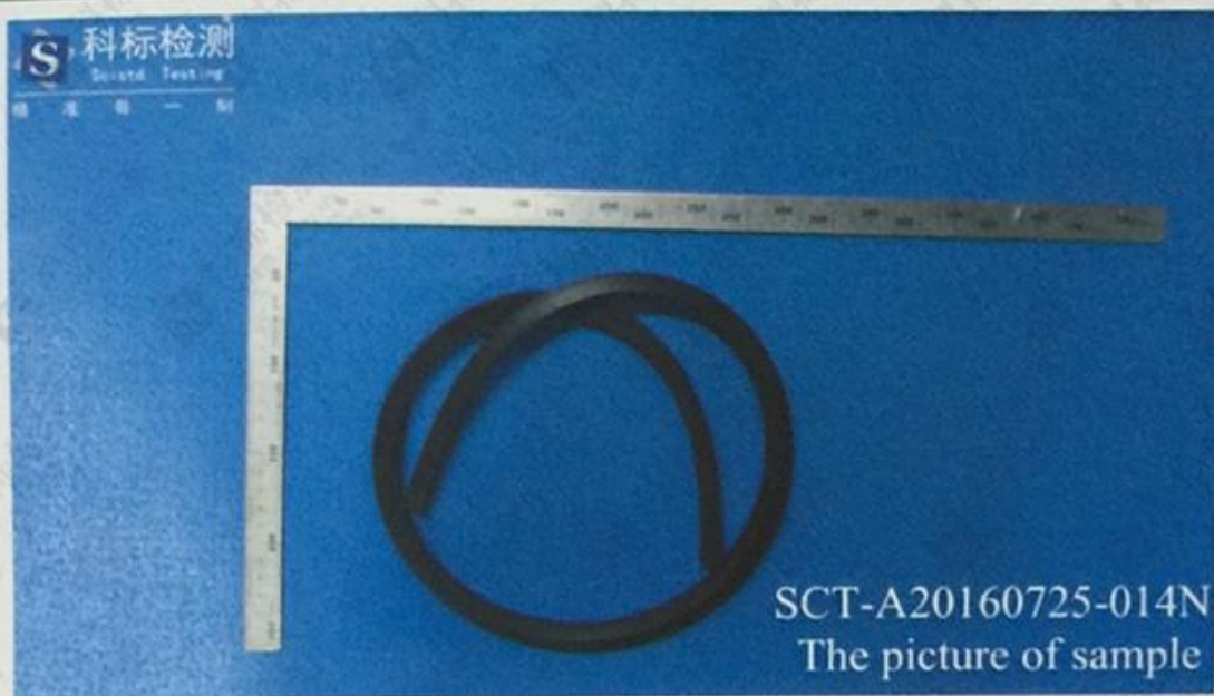
Fig.1 The picture of sample